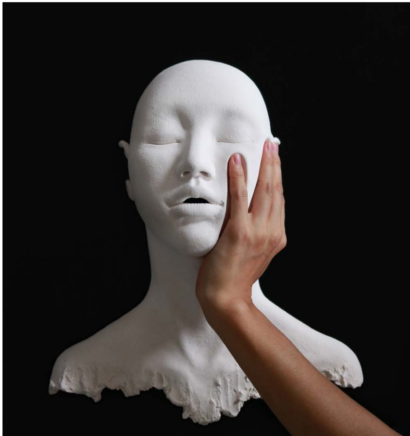
Warm Thoughts 2021 ceramics and heating wire 13 x 12 x 5 inches