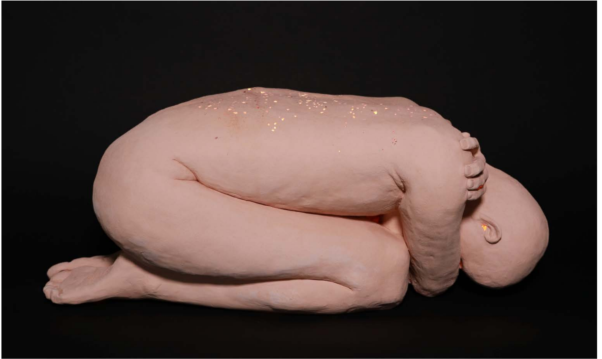
Man of Signs , 2021, ceramic and a light, 9 x 23 \frac{3}{4} x 11 inches