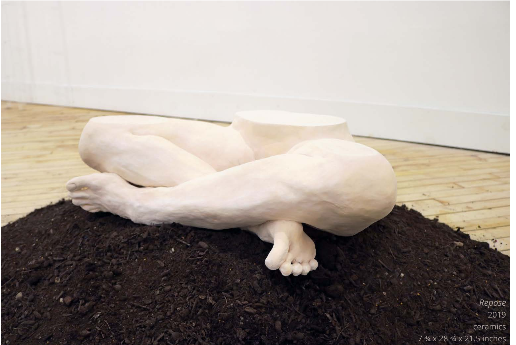
Repose 2019 ceramics