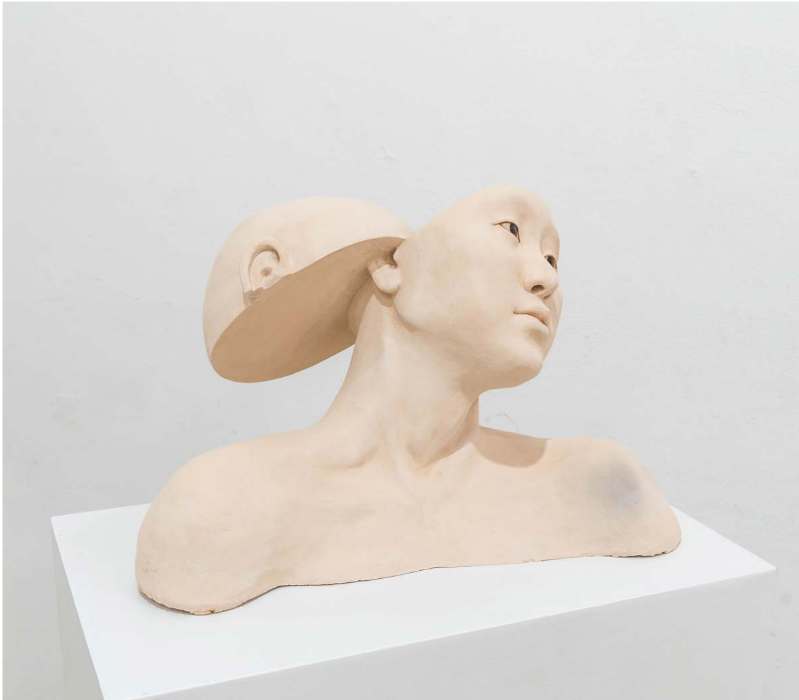
Bi-polar 2019 ceramics and epoxy 11 ¼ x 16.5 x 9.5 inches