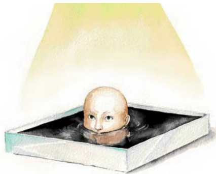
Floating 2021 ceramics 8.5 x 8 7/8 x 10 3/4 inches