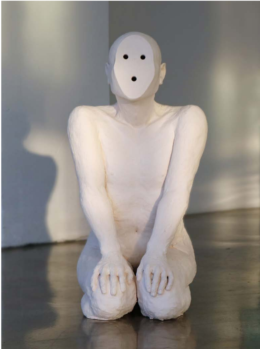
Face to Face 2019 ceramics 33 x 16.5 x 24 inches