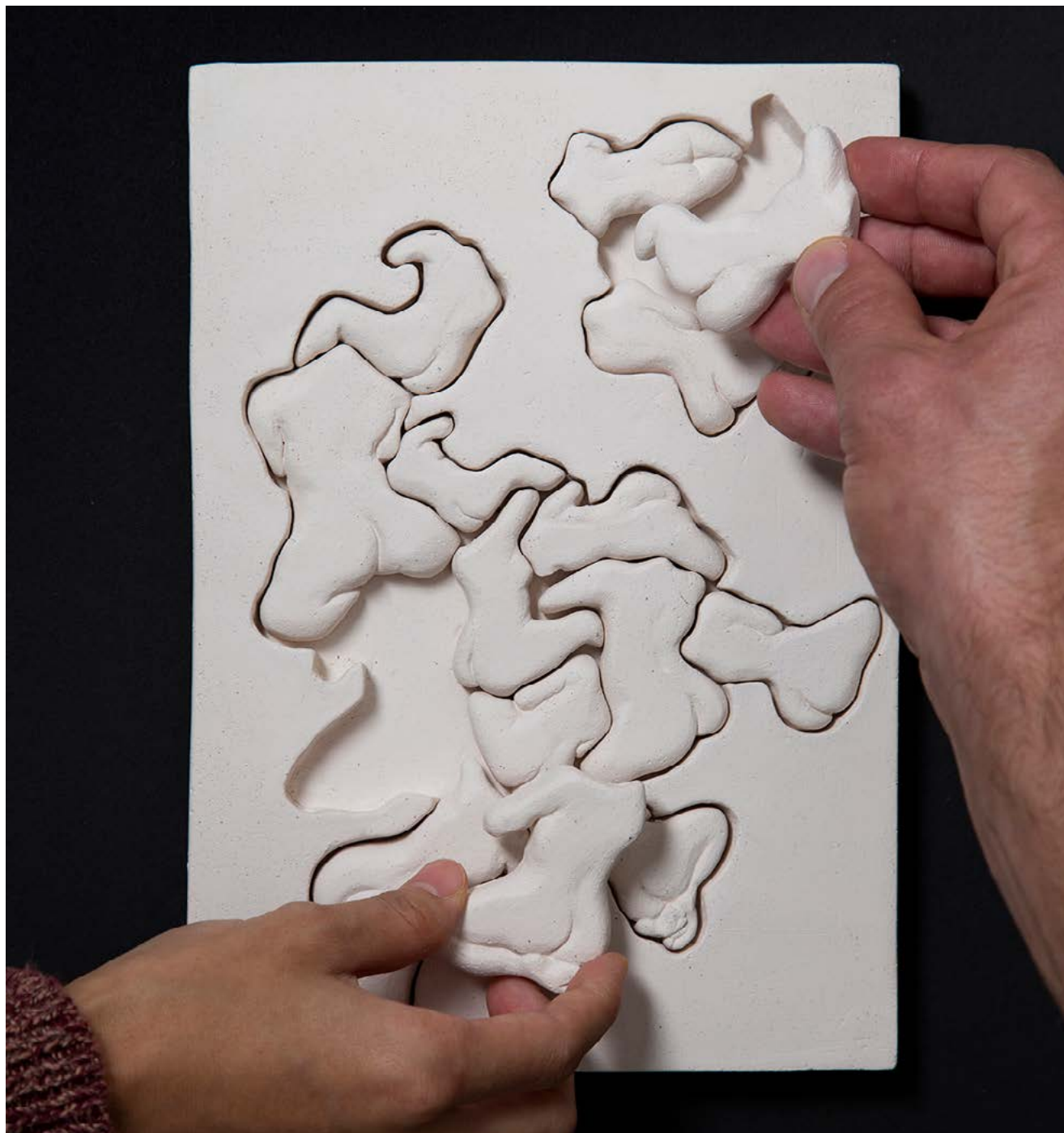
Untitled (puzzle) 2018 ceramics 1 x 6 x 8 inches