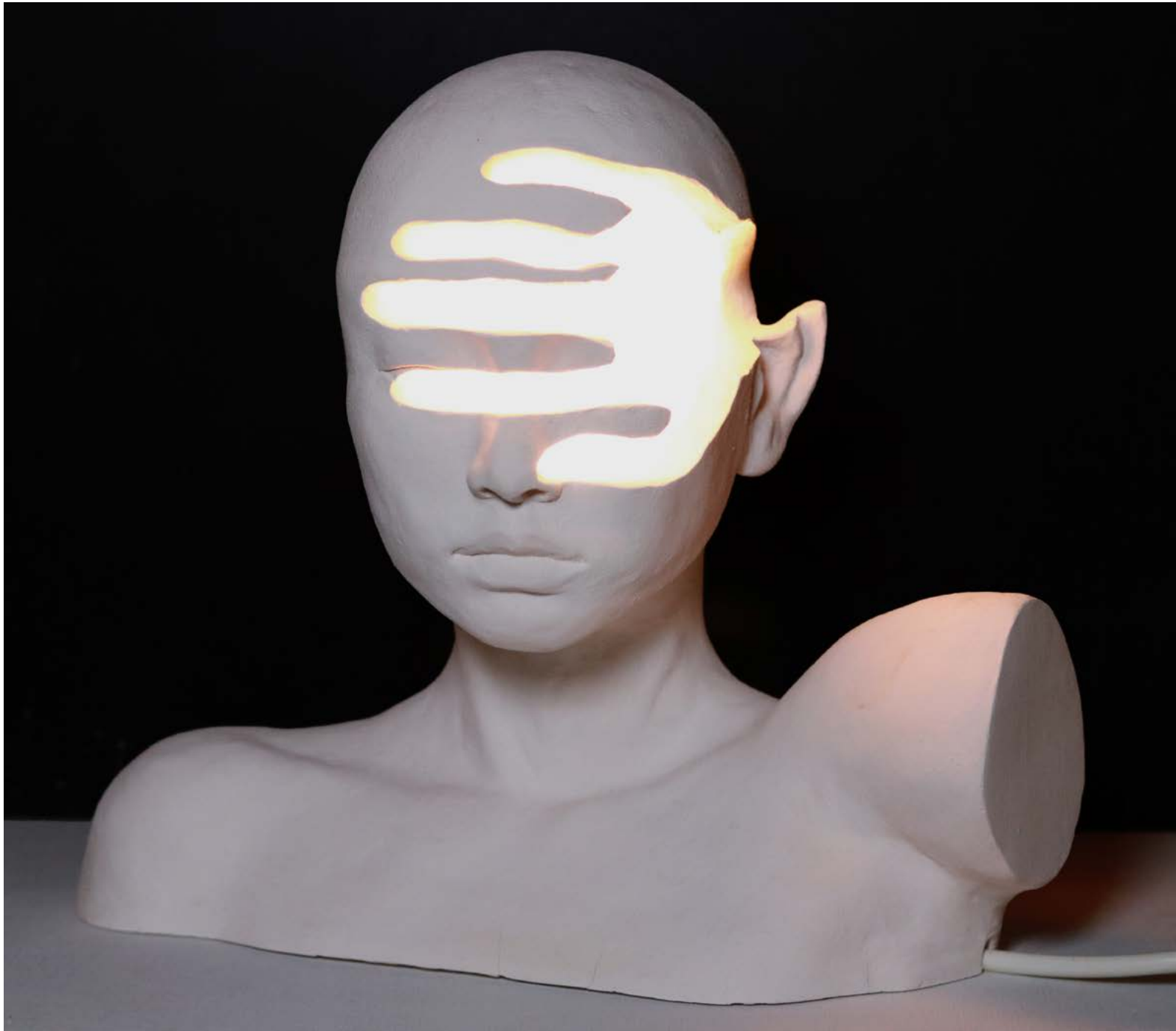
Dazzling 2020 ceramics 10 x 12 x 6 inches